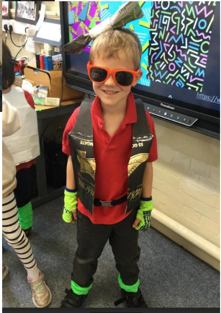
Year 1 recycling fashionistas